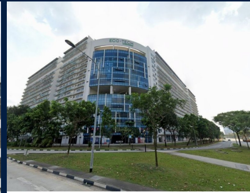
3RD, 5TH - 7TH STOREY (PRODUCTION UNITS)